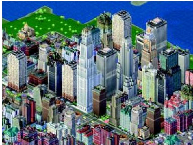
Is SimCity a game?

You play with a toy while you play a game. With a toy there are no predefined goals although during play you tend to set such goals yourself. A number of computer games actually are close to being toys. For example, in SimCity or The Sims there are no clearly defined goals. You can build your own city or family and most likely set your own goals (like creating the biggest city) but there is not really a notion of winning the game. One could add this (e.g. you could add that the game is won when your city has reached a particular population) but this can be frustrating because it is not a natural ending. This being said, there is nothing wrong with creating a nice interactive computer toy.